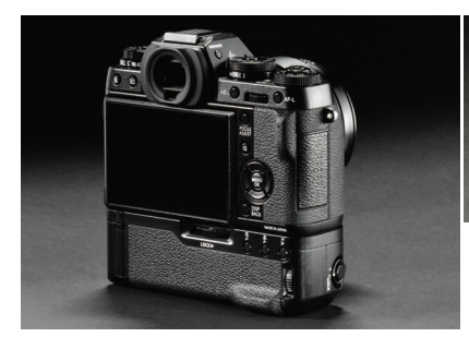
Compatible with: X-T1

This grip has the same dust- and splash-resistant structure as the cameras in X-T1 series. It features a shutter release button, AE-L / AF-L and focus assist buttons, as well as twin command dials for excellent operability when you hold the camera vertically. The tripod mounting socket at the base of the grip is aligned with the optical axis. It houses an auxiliary battery (NP-W126) to enable the shooting of approx. 700 shots on a single charge when combined with the camera body battery.