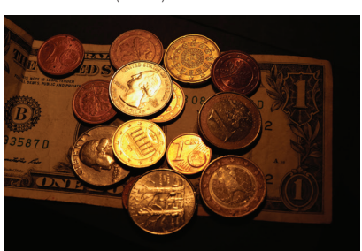
XF35mmF1.4 R with MCEX-11 (x0.47)